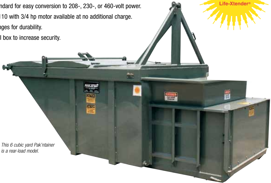
This 6 cubic yard Pak'ntainer is a rear-load model.