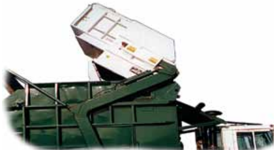
Pak'ntainer is designed for compatibility with a wide variety of collection vehicles.