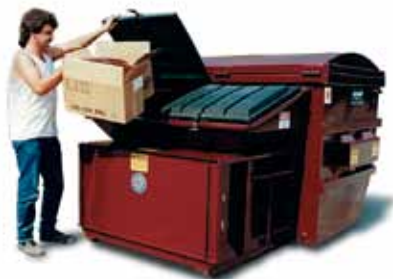
Pak'ntainer with optional hopper and plastic lids to keep contents in, rain out.