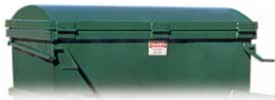
Easy-to-operate latch — saves on time and maintenance.